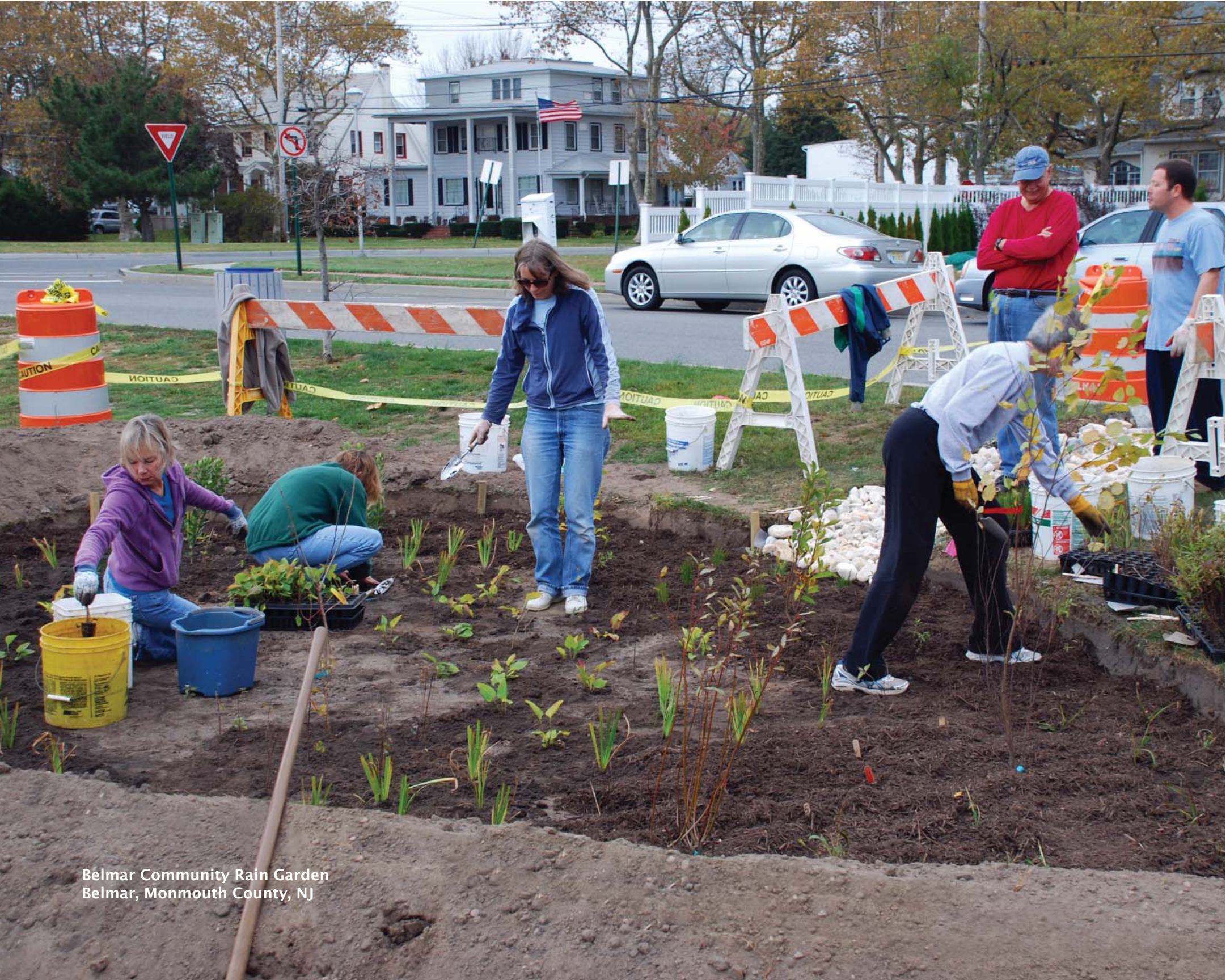
Belmar Community Rain Garden Belmar, Monmouth County, NJ