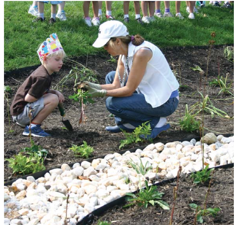
Village School Holmdel, NJ

Go outside to the site or your rain garden. Referring to your sketches and notes from Chapter 2, use a garden hose, rope, or spray paint to layout the shape of the rain garden. Make sure that the placement of the rain garden does not conflict with any of the utility markouts including underground gas, water, sewer, cable, telephone, and electric.