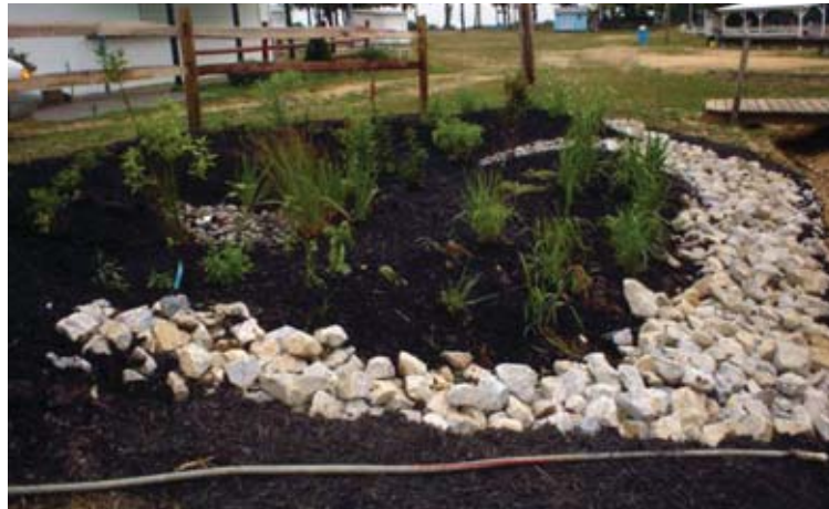
Second growing season