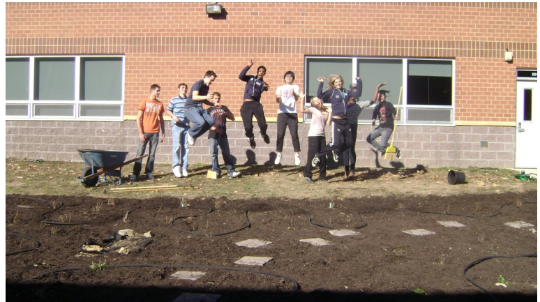
Kids jumping for joy after building their rain garden.

stormwater management practices such as rain gardens and rain barrels.