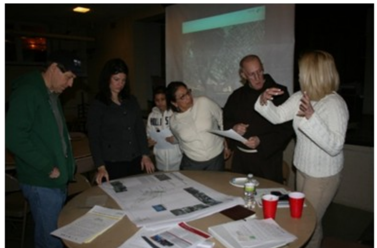
Engaging stakeholders in the Cramer Hill section of Camden

During winter and spring 2011, a series of public meetings were held in the City of Camden. Five individual evening meetings were scheduled in various locations throughout the City. Each meeting targeted residents within four or five of the City's 20 unique neighborhoods. Our local partner, the New Jersey Tree Foundation (NJTF) helped to facilitate and organize the meetings. The purpose of the meetings was to educate residents about the issues of combined sewer systems and the benefits and opportunities of green infrastructure. In addition, residents were asked to provide information on localized flooding and sewer backups in their