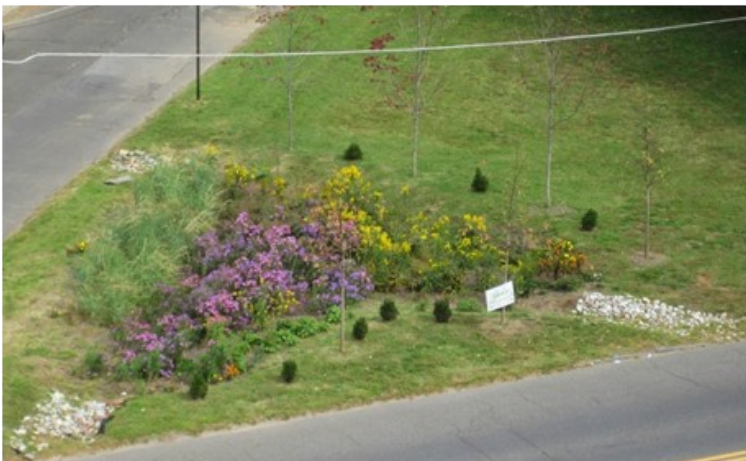
Ferry Avenue rain garden in Camden

Partnering with local community-based organizations is critical to establishing lasting relationships in the City. Each of the City's 20