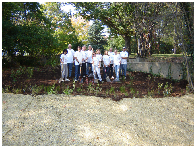
Volunteers assist with a demonstration rain garden project at the New Jersey Highlands Council grounds in Chester, New Jersey.