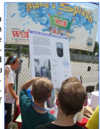
Children learn about Rain Barrels at the Make a Splash Festival , Egg Harbor Township, NJ.

Teachers from the City of Rahway, East Greenwich Township, and Egg Harbor Township have been trained in this program. Teachers who finish the Project WET course are eligible for a $1,500 grant to hold a Make a Splash Water Festival . Egg Harbor Township received a grant and held their first student run Egg Harbor Township Make a Splash Water Festival on June 2, 2010. An important component of this program is the take home message. Students will have an opportunity to apply their knowledge of water conservation with their families at home.