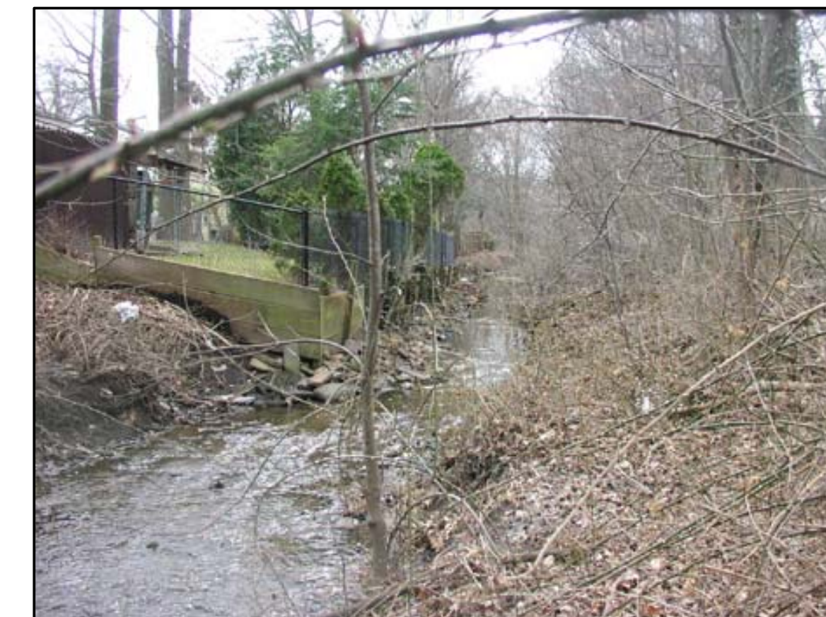
PICTURE 3: CONSTRICTION OF THE STREAM BEGINS HERE AND INCREASES DOWN STREAM.