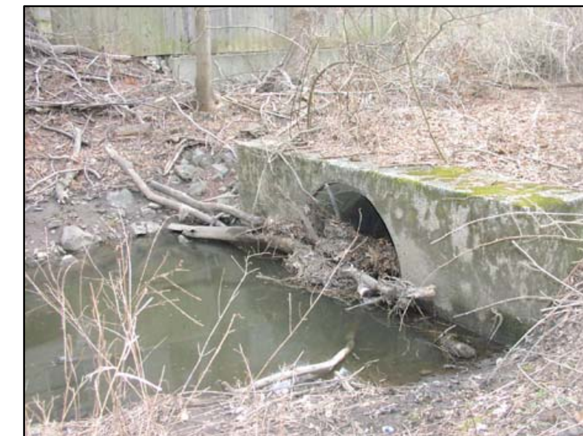
PICTURE 2: OBSTRUCTED INLET, REDUCES THE FLOW ENTERIN THE CONSTRICTED AREA.