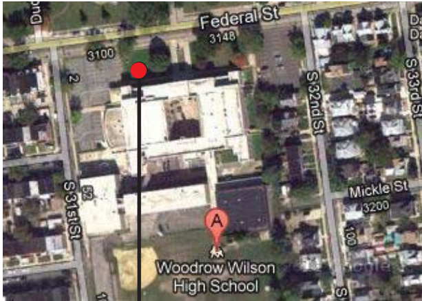
RAIN GARDEN LOCATION

With a drainage area of approximately 1,000 ft 2 , this rain garden is 6 inches deep with an area of 250 ft 2 . This system will disconnect the downspout located on the north facade of the building and will capture, treat, and infiltrate the stormwater. It is designed to treat stormwater runoff from a 2" rain event at an infiltration rate of 0.5" per hour.