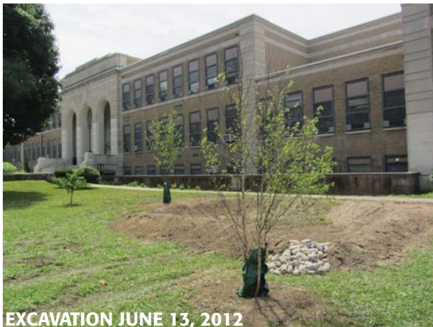
EXCAVATION JUNE 13, 2012

With a drainage area of approximately 1,000 ft 2 , this rain garden is 6 inches deep with an area of 250 ft 2 . This system will disconnect the downspout located on the north facade of the building and will capture, treat, and infiltrate the stormwater. It is designed to treat stormwater runoff from a 2" rain event at an infiltration rate of 0.5" per hour.