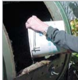
Use to keep compost bin moist.