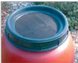
A barrel covered with window screen can be placed under a roof valley to collect rainwater runoff.

Elevating the rain barrel on a platform, such as cinder blocks, will give additional water pressure and will provide clearance for connecting a hose or filling a watering can.