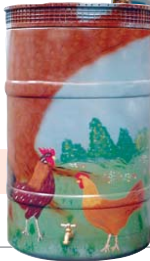
Rain barrels may be painted to increase their aesthetic value.