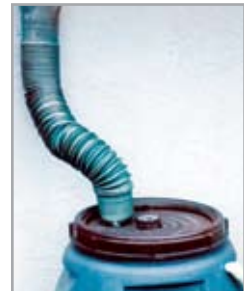
Flexible downspout extender