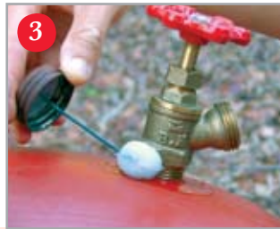
When the spigot is in about halfway, apply a liberal amount of PVC cement to the exposed threads. Continue to screw in the spigot until it is snug and pointing toward the bottom of the barrel.