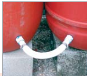
Connecting rain barrels together will allow for more water collection.