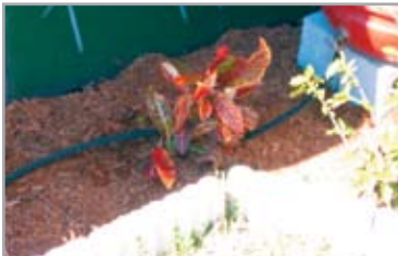
Attach a soaker hose to water nearby plants.