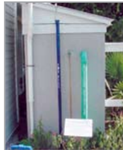
These cisterns at the Florida House Learning Center each hold 2,500 gallons of rainwater.