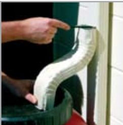
Mark downspout for cutting

To make the transition from the gutter/downspout to your opening in the rain barrel, you can fabricate a crosspiece out of downspout material or purchase a flexible downspout extender. The flexible downspout extender eliminates the need for exact measurement because it bends and stretches to the length you need. Make sure the downspout extender fits the size of your downspout.