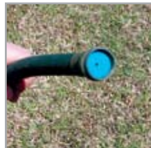
Remove the pressure-reducing washer from the soaker hose.