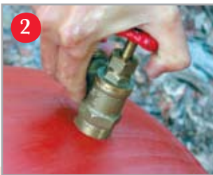
Next, screw in the hose spigot about halfway. Make sure the threading is going in straight, as this will help prevent leaking.