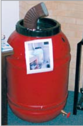
Hillsborough County Extension Service has a demonstration rain barrel.

Many county Extension offices have rain barrel demonstration exhibits where you can see examples of rain barrels that any homeowner can install. The Extension offices also provide an abundance of information on plants, gardening, composting and water conservation. Most county Extension offices offer workshops on all of these subjects.