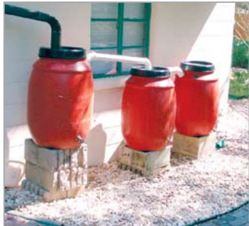
Multiple barrels provide for greater water storage.

Cisterns and rain barrels have been around for thousands of years and the time has come for more homeowners to enjoy their benefits.