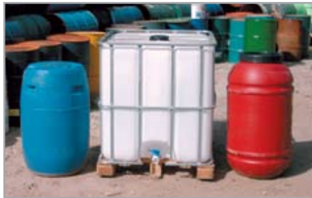
Some common containers used for rain barrels are (left to right): 50-gallon sealed barrel, 275-gallon juice container, 50-gallon open-top barrel.