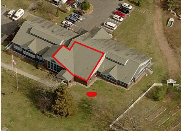
Environmental Park 6700 West Delilah Road, NJ Egg Harbor Township